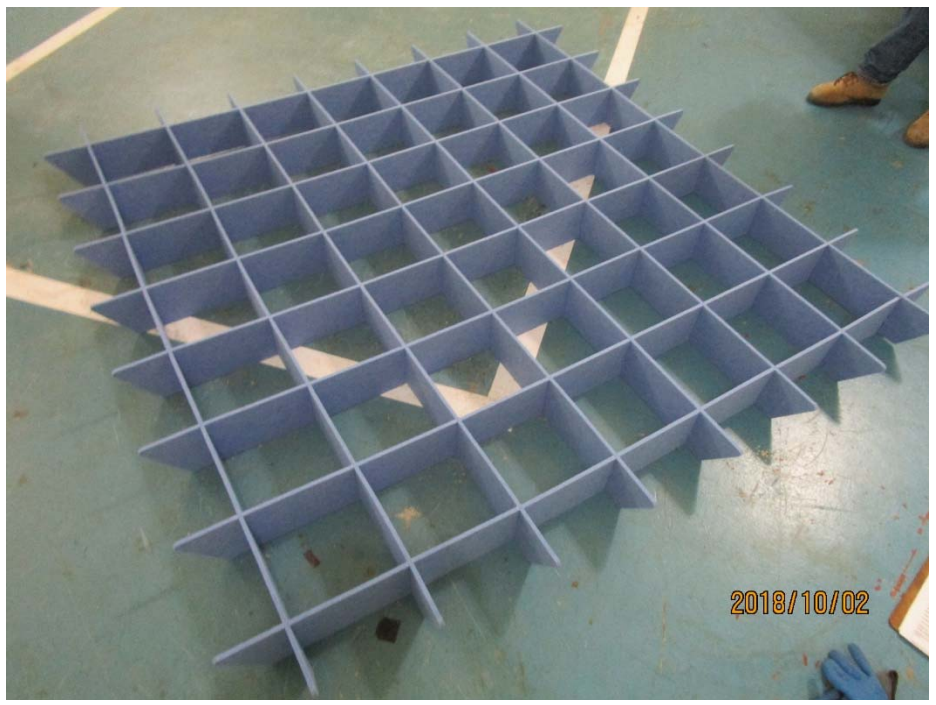
Figure 2 – Assembled specimen prior to mounting