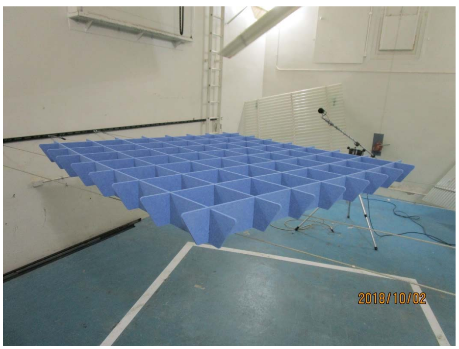
Figure 1 - Specimen mounted in test chamber