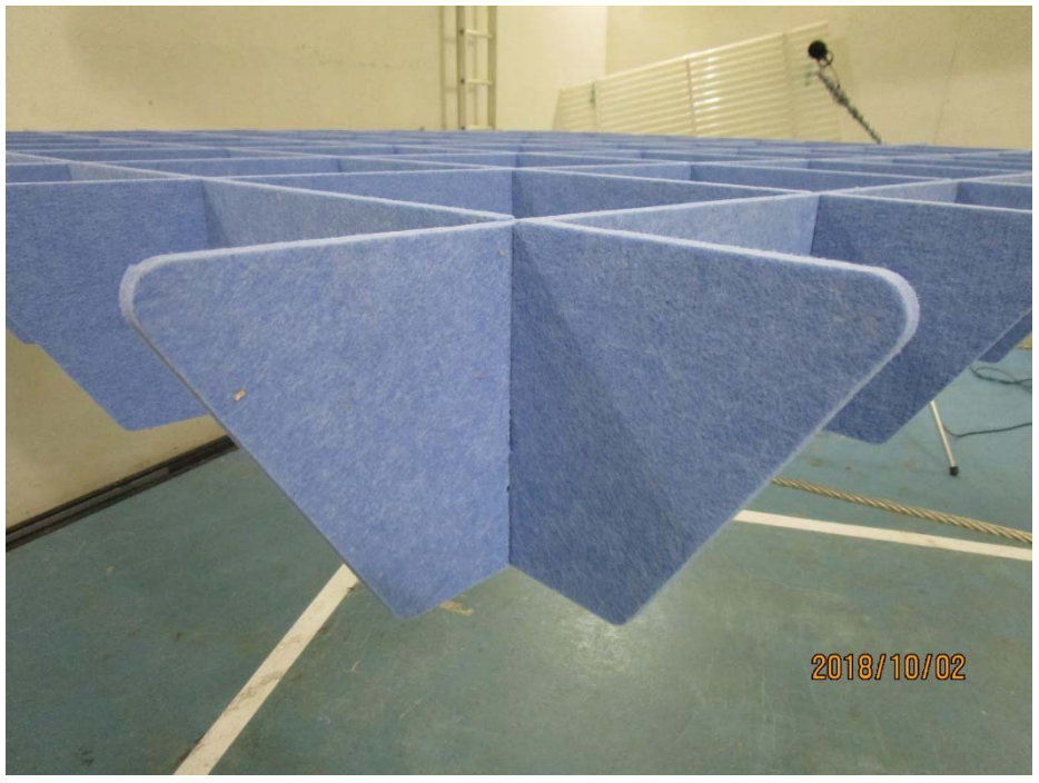
Figure 3 – Detail of specimen material